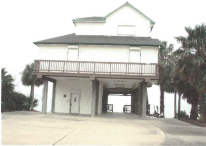
FRONT VIEW (3/18/13)

If using the Elevation Certificate to obtain NFIP flood insurance, affix at least 2 building photographs below according to the instructions for Item A6. Identify all photographs with date taken; "Front View" and "Rear View"; and, if required, "Right Side View" and "Left Side View." When applicable, photographs must show the foundation with representative examples of the flood openings or vents, as indicated in Section A8. If submitting more photographs than will fit on this page, use the Continuation Page.