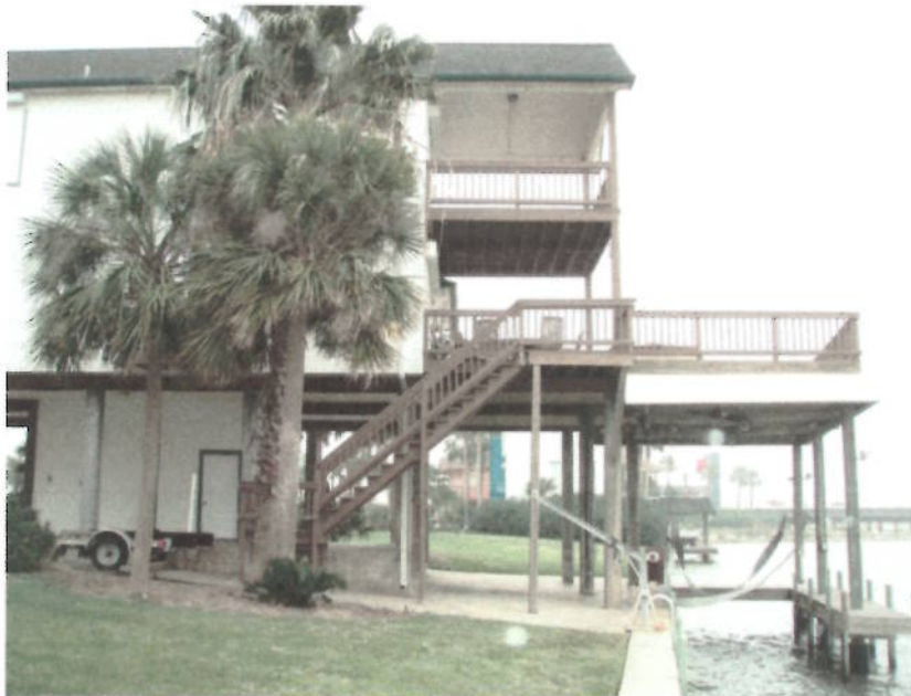
RIGHT SIDE VIEW (3/18/13)