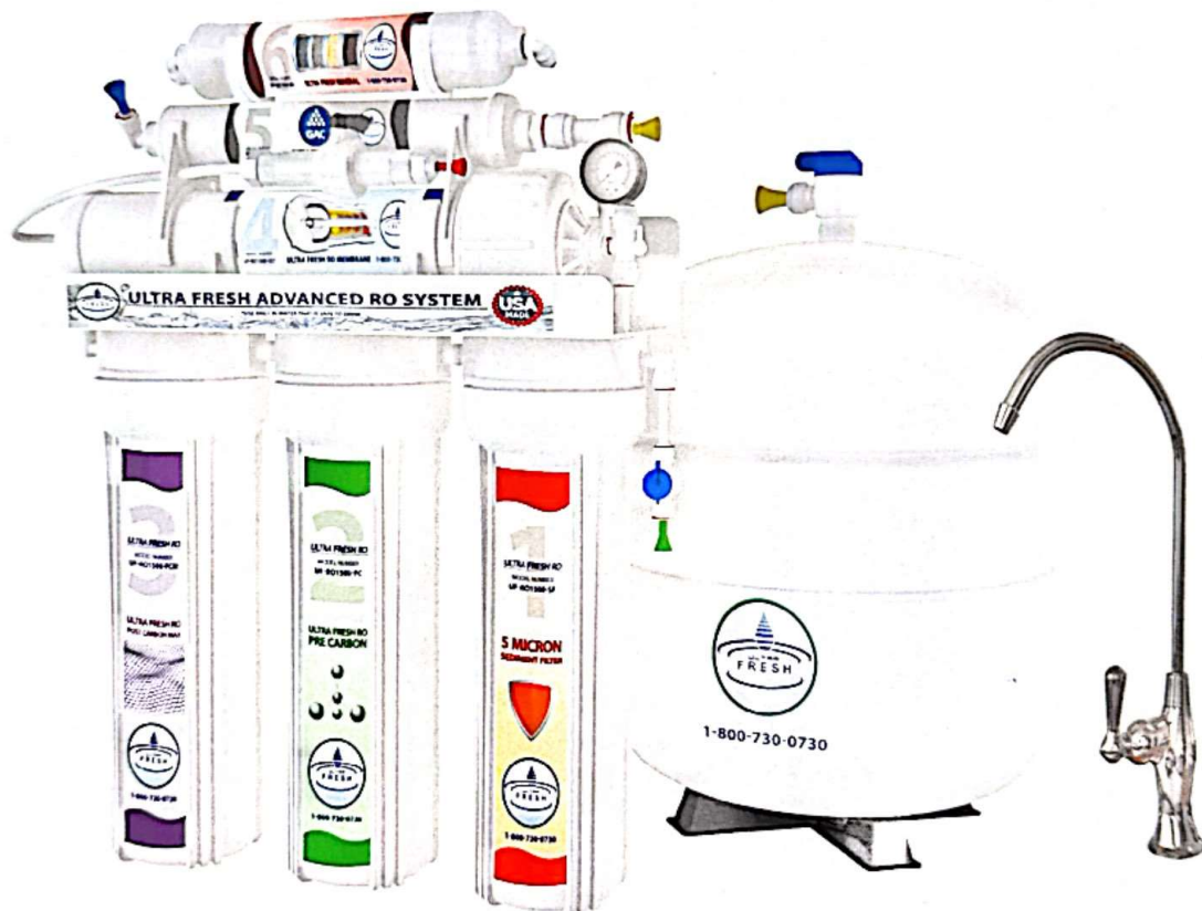
6- Stage Advanced Reverse Osmosis Water System