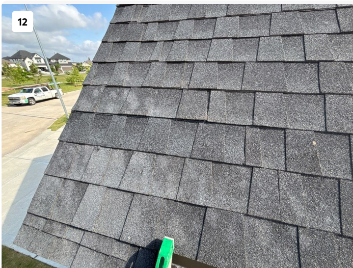
Project: 2506 Seedling St Date: Apr 22, 2025, 10:07 AM Creator: Angel Gomez