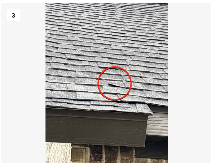
Project: 2506 Seedling St Date: Apr 22, 2025, 9:03 AM Creator: Angel Gomez