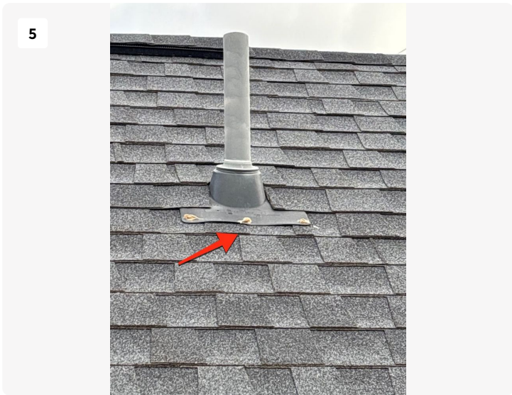
Project: 2506 Seedling St Date: Apr 22, 2025, 9:12 AM Creator: Angel Gomez