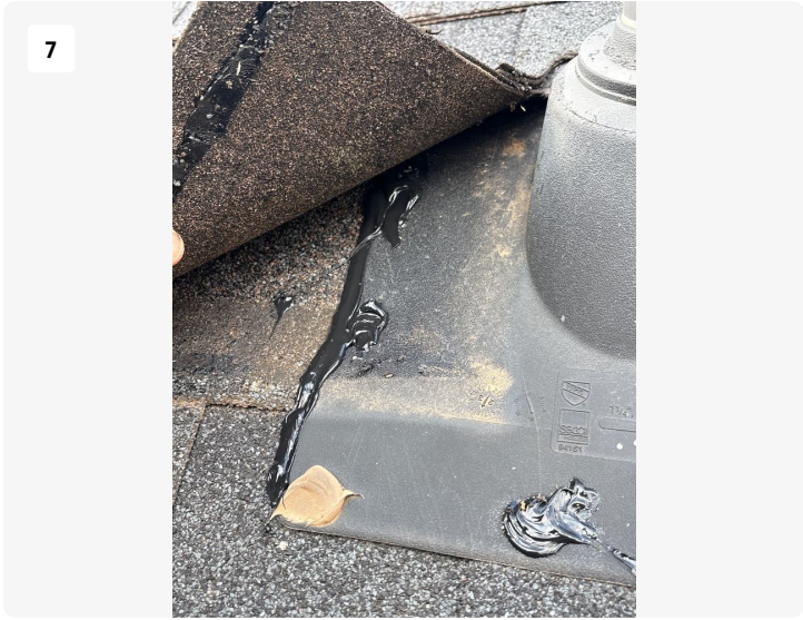
Project: 2506 Seedling St Date: Apr 22, 2025, 9:17 AM Creator: Angel Gomez