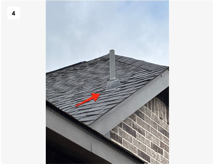
Project: 2506 Seedling St Date: Apr 22, 2025, 9:06 AM Creator: Angel Gomez