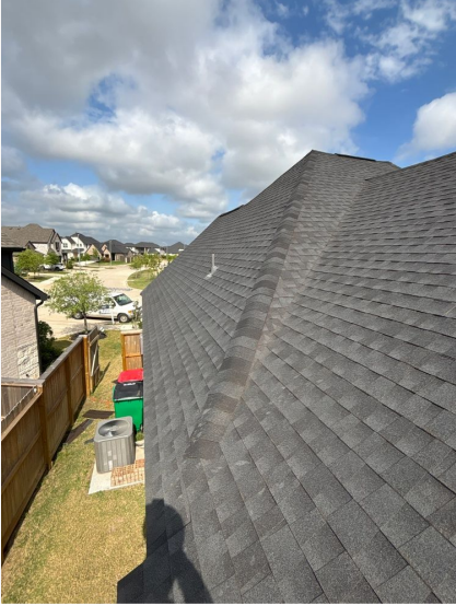
Project: 2506 Seedling St Date: Apr 22, 2025, 10:18 AM Creator: Angel Gomez