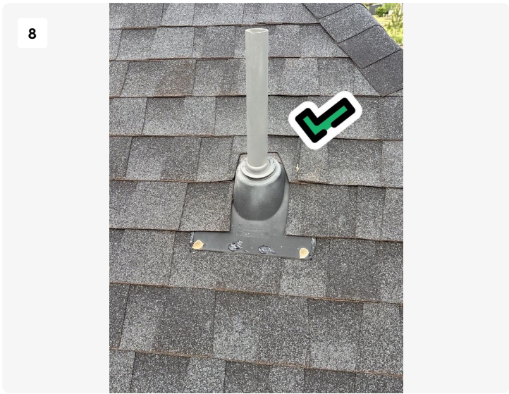
Project: 2506 Seedling St Date: Apr 22, 2025, 9:18 AM Creator: Angel Gomez