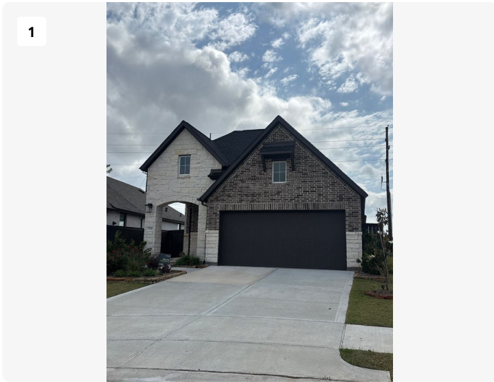
Project: 2506 Seedling St Date: Apr 22, 2025, 10:32 AM Creator: Angel Gomez