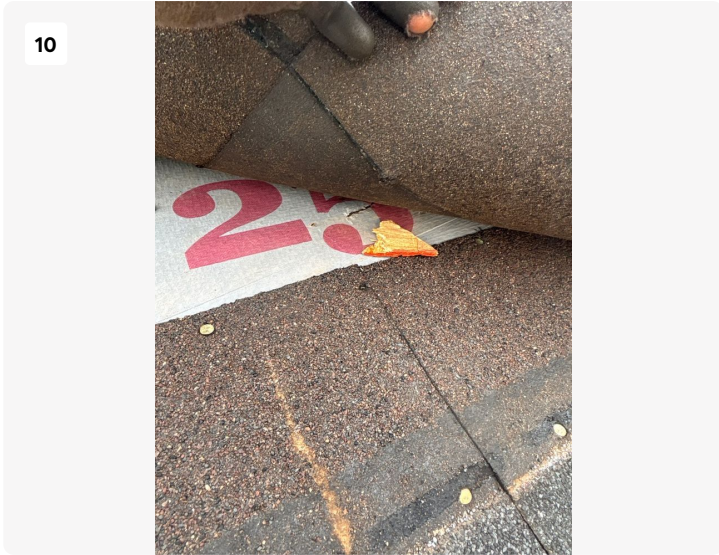
Project: 2506 Seedling St Date: Apr 22, 2025, 9:47 AM Creator: Angel Gomez