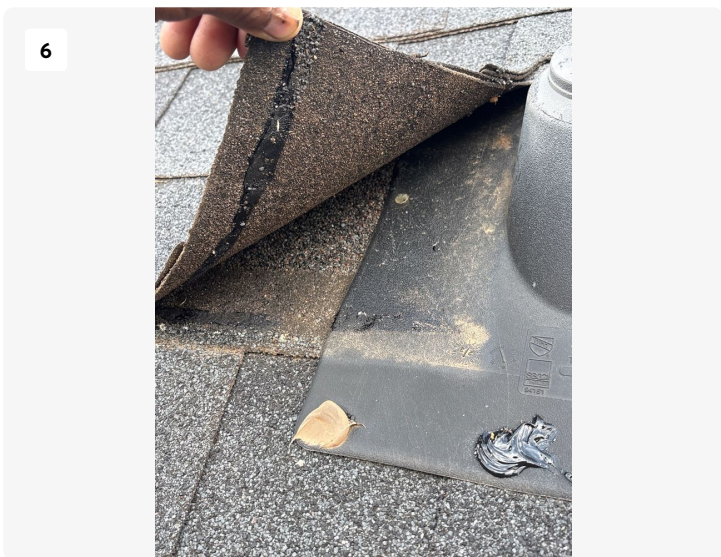
Project: 2506 Seedling St Date: Apr 22, 2025, 9:16 AM Creator: Angel Gomez