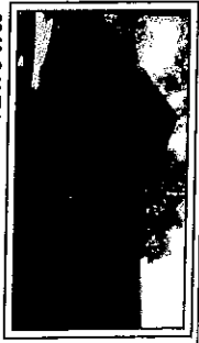
6910 CAYTON STREET

THIS LOT DOES NOT LIE IN THE 100 YEAR FLOOD ZONE