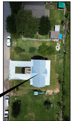
3611 Jean Drive