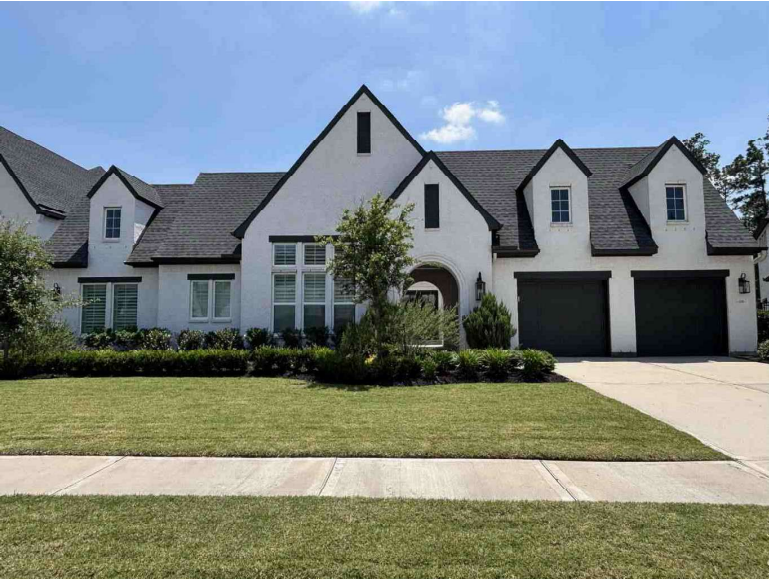
Subject Front 4306 Worthington Dr