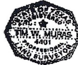
EXHIBIT "A" - Page 2