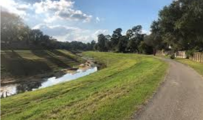
Faulkey Gully Hike and Bike Trail