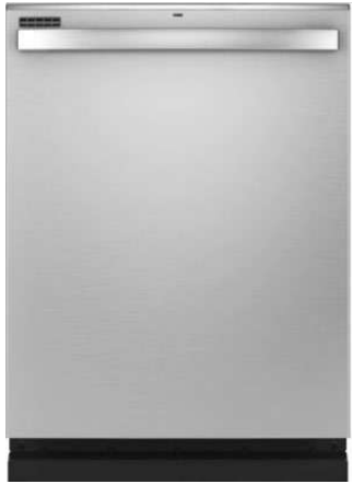
GE Profile Appliances