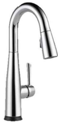
Chrome Essa Touch Delta Faucet