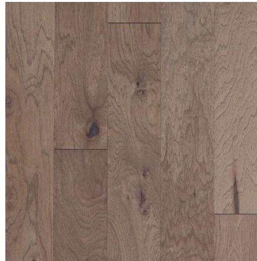
Engineered Wood Floor