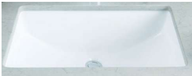
White Undermount Sink