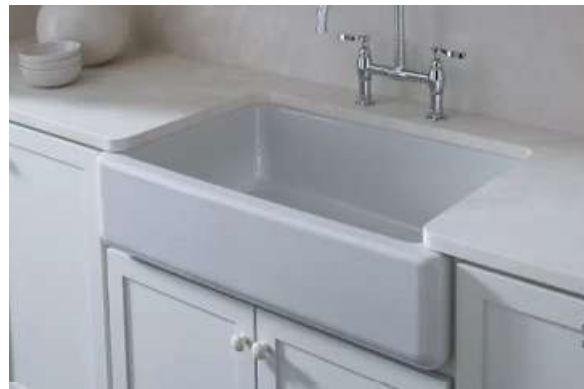
Apron Front Farmhouse Sink