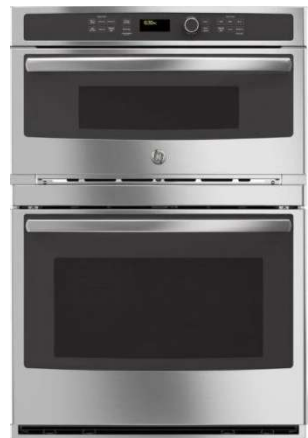
GE Café Range Top