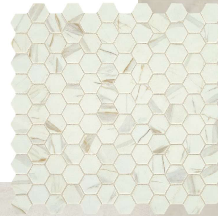
Hex Shower Floors