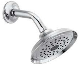
Chrome Woodhurst Delta Fixtures