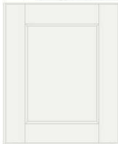
White Painted Cabinets