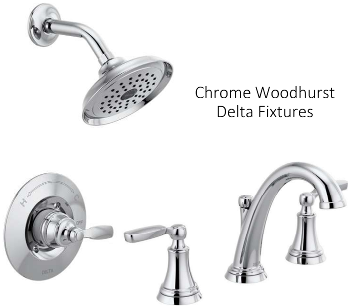
Chrome Woodhurst Delta Fixtures