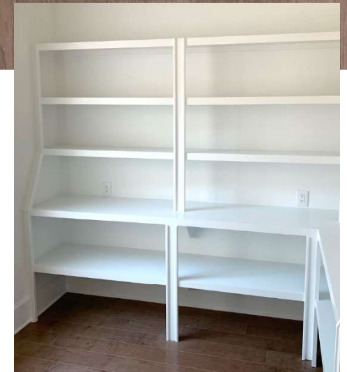
Chef's Pantry Shelving