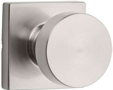
Stain Nickel Knob