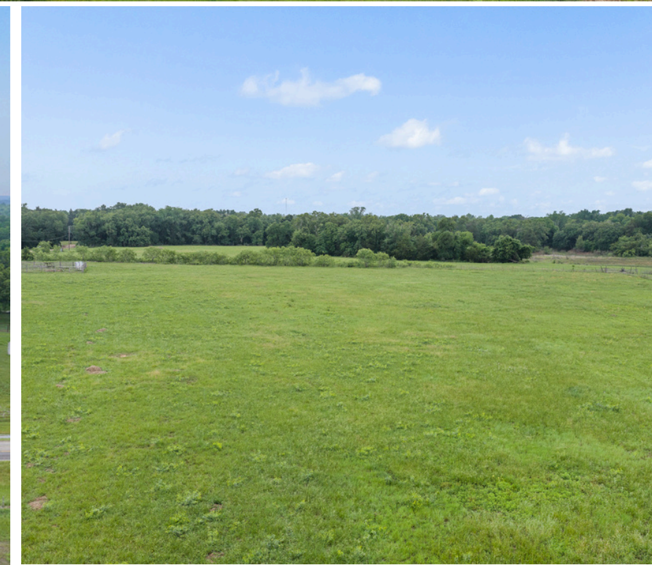
Estimated Property Lines