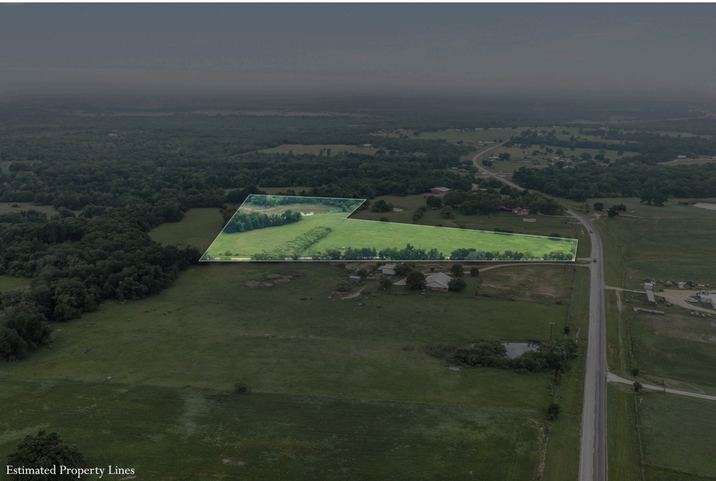
Estimated Property Lines