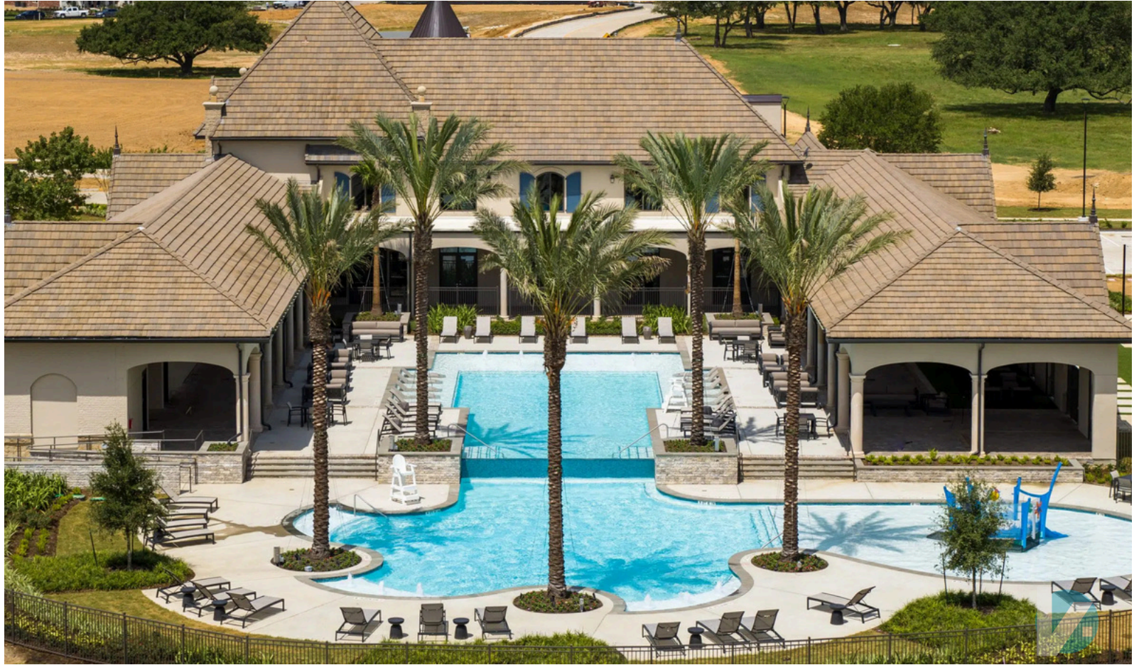
Located in a master-planned community, amenities include lakes, a pool, gym, pickleball courts, parks, a dog park, and walking trails.