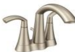
Brushed Nickel Finishes