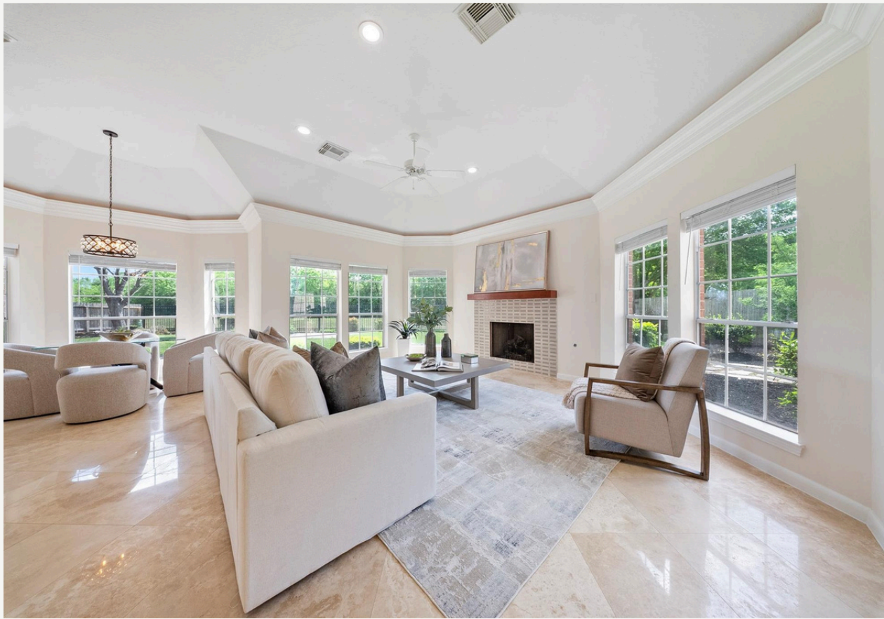
Bright and inviting living room featuring a tray ceiling, fireplace focal point, and walls of windows overlooking the backyard.