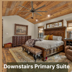
Downstairs Primary Suite