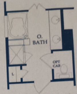
Opt Owner's Bath 1