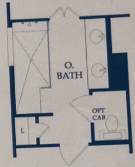
Opt Owner's Bath 2