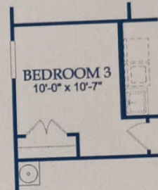
Opt Bedroom 3