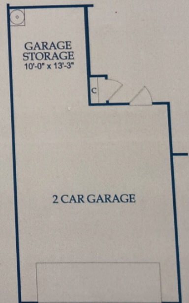
Opt 4'-0" Garage Ext