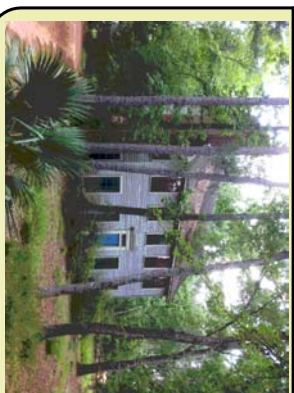
NOTE: MAY BE SUBJECT TO DEED RESTRICTIONS AND/OR ADDITIONAL GOVERNMENTAL BUILDING REQUIREMENTS.

ACCORDING TO THE MAP OR PLAT THEREOF RECORDED IN CABINET C, SHEET 31A OF THE MAP RECORDS OF MONTGOMERY COUNTY, TEXAS