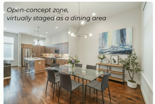
Open-concept zone, virtually staged as a dining area