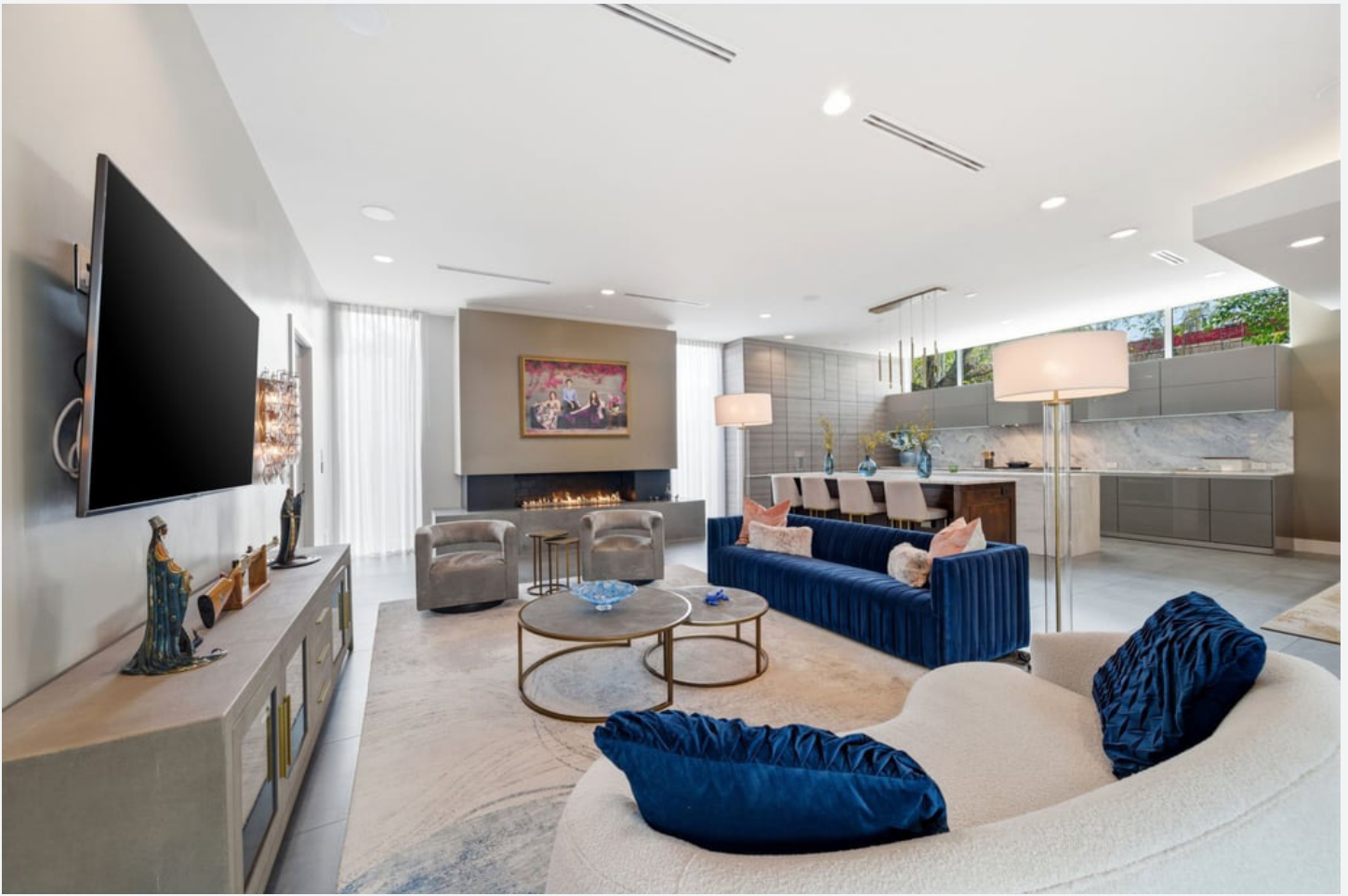
Seamless integration of interior elegance with lush outdoor surroundings, creating a private sanctuary defined by modern sophistication.