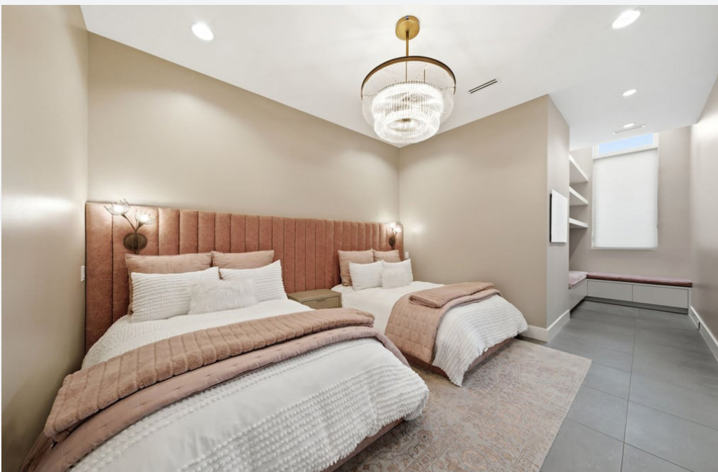
Serene and sophisticated guest retreat featuring plush upholstered headboards, layered textures, and warm ambient lighting for an elevated sense of comfort.