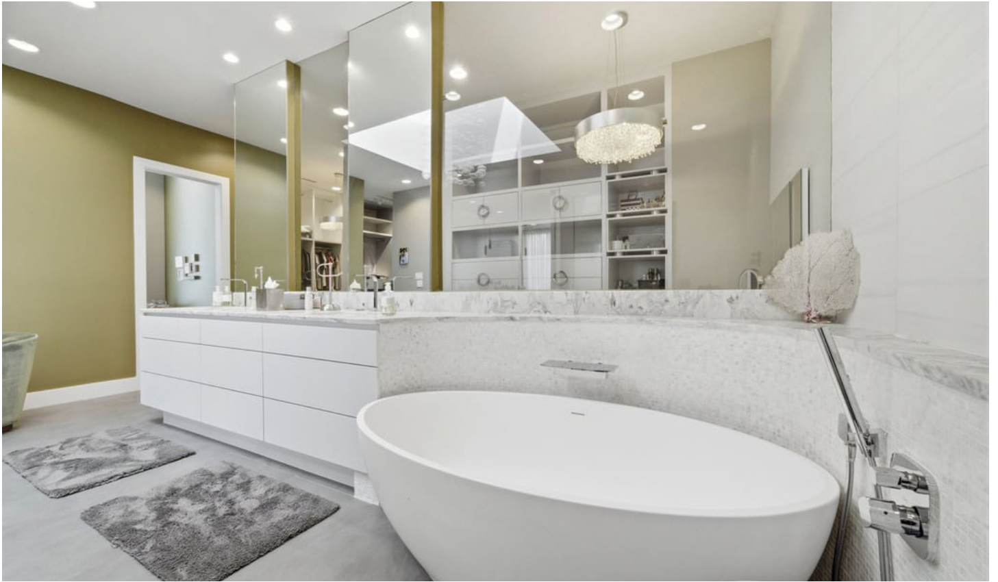
Spa-inspired primary bath featuring a freestanding soaking tub, expansive dual vanity, and floor-to-ceiling mirrors with elegant designer finishes.