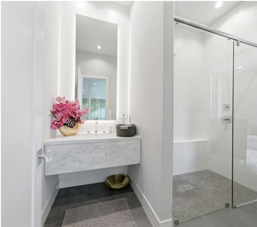
Bright and refined bath with a sleek glass-enclosed shower, floating vanity, and contemporary lighting accents.