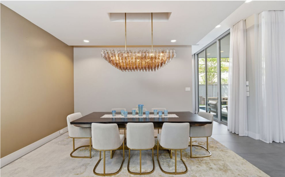
Striking formal dining space anchored by a statement chandelier, seamlessly blending modern elegance with effortless indoor-outdoor flow.