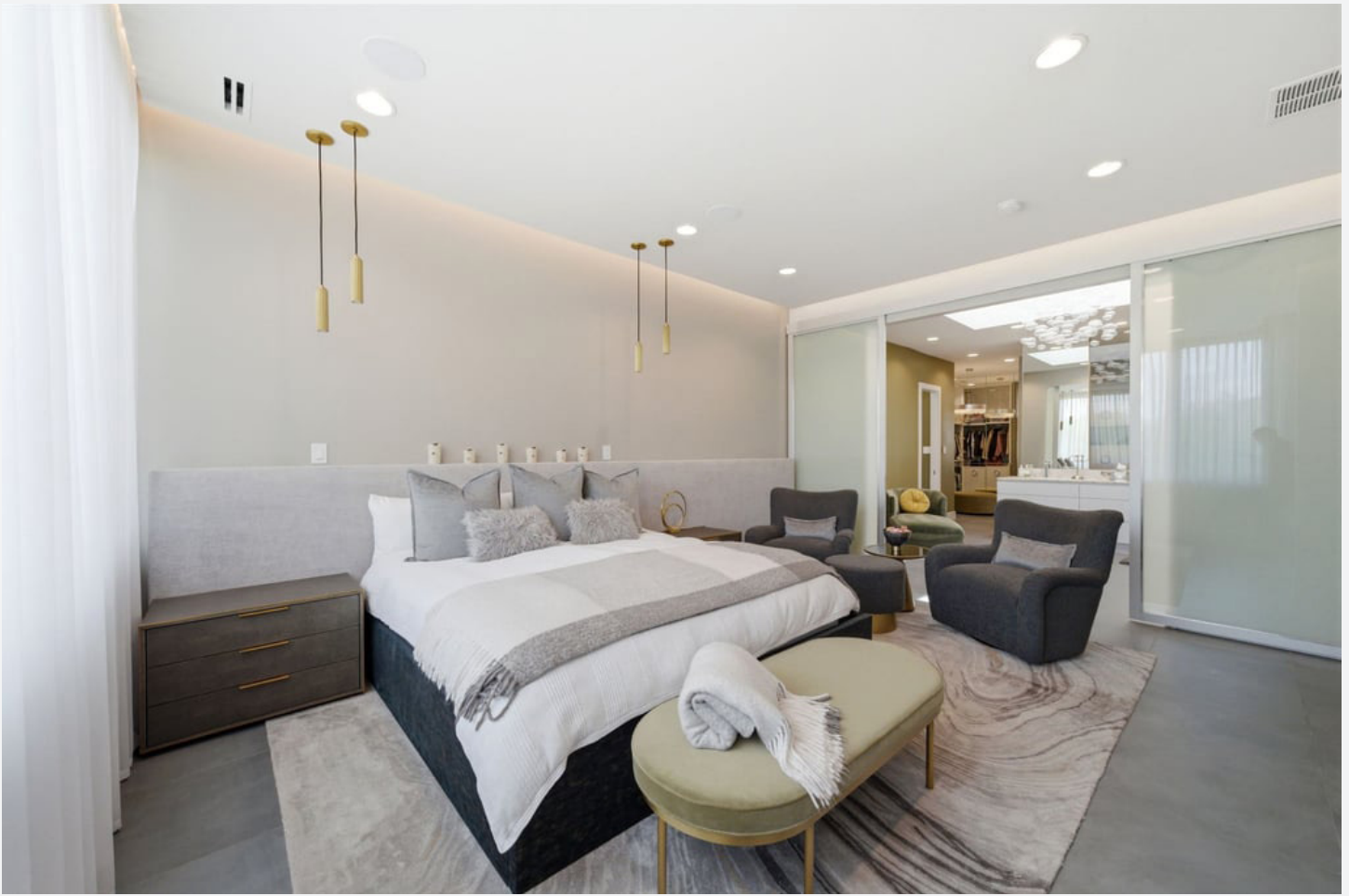
Sophisticated dining with a touch of luxury — clean lines, warm white oak cabinetry, and a mirrored dry bar create the perfect balance of function and style.