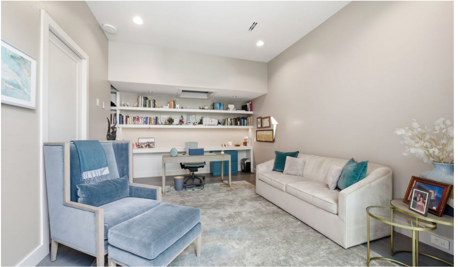
Thoughtfully designed workspace and lounge with custom built-ins, soft neutral tones, and refined finishes—perfect for both productivity and relaxation.