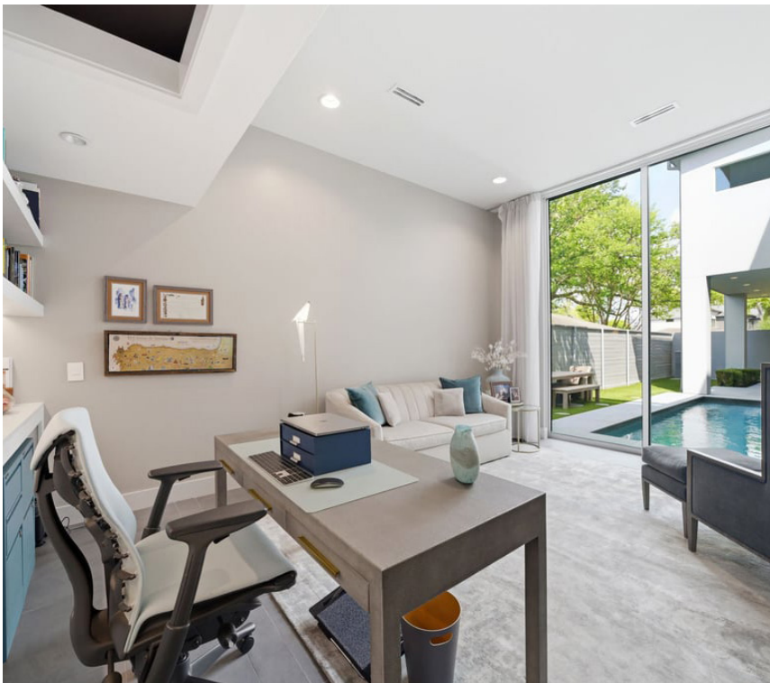
Light-filled executive office overlooking a private outdoor oasis, offering a tranquil setting with seamless connection to nature.