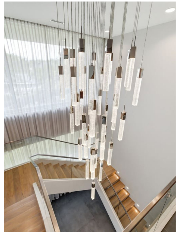
Striking architectural staircase highlighted by a dramatic multi-pendant chandelier and floor-to-ceiling natural light.