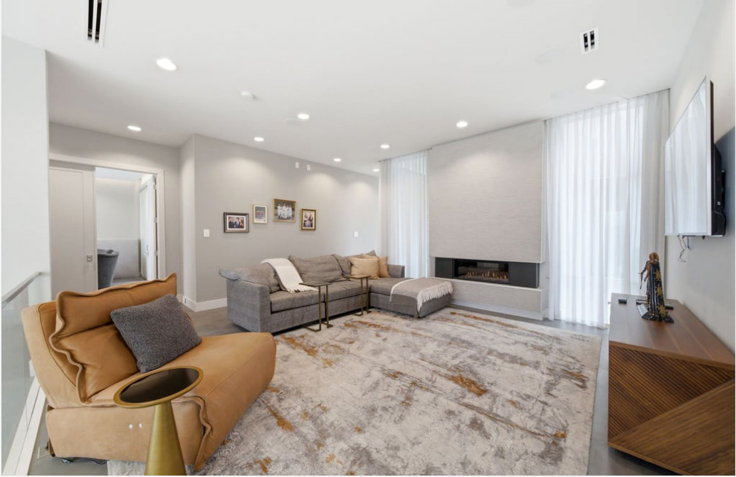
Refined material palette showcasing artisanal textures and bespoke finishes—where every detail reflects elevated craftsmanship.