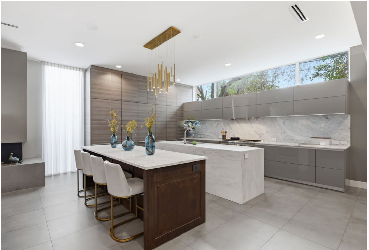
Showcase chef's kitchen with sleek custom cabinetry, waterfall marble island, and designer lighting—crafted for both everyday living and stylish entertaining.