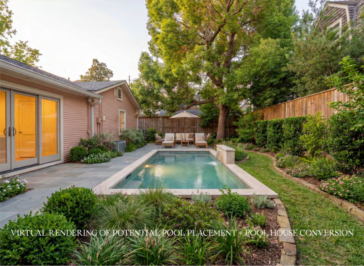
VIRTUAL RENDERING OF POTENTIAL POOL PLACEMENT + POOL HOUSE CONVERSION

This virtual rendering helps envision the space that is perfect for adding a pool in the future as well as opening up the current guest quarters for a future pool house.