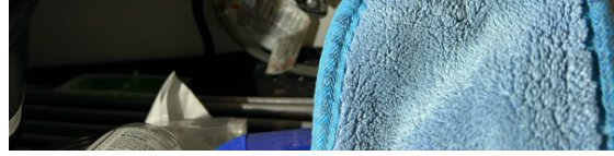
Other Treatment Photos

Bait is still full. No current signs of termite activity. No need to change bait.