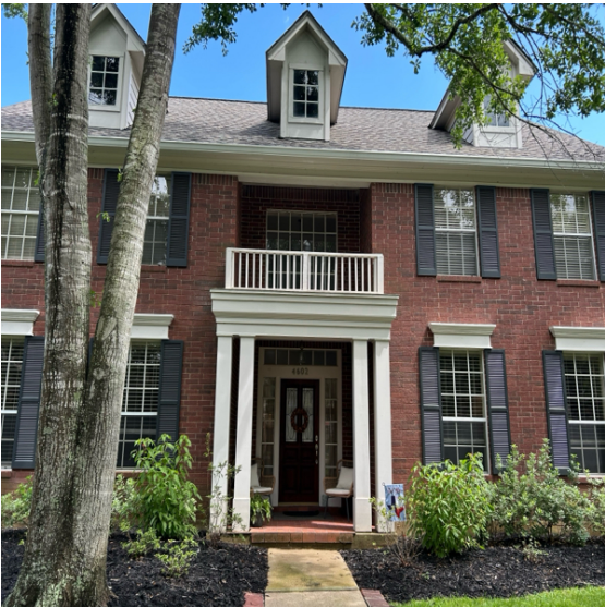
Other Treatment Photos

Checked all bait stations around the home no current signs of termite activity