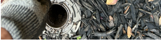
Other Treatment Photos

Bait is still full. No current signs of termite activity. No need to change bait.