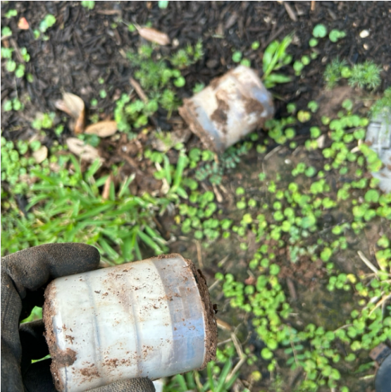
Other Treatment Photos

Bait is still full. No current signs of termite activity. No need to change bait.