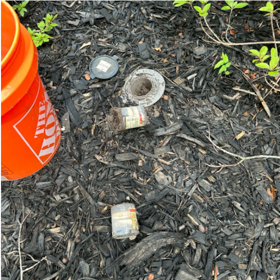
Other Treatment Photos

Bait is still full. No current signs of termite activity. No need to change bait.