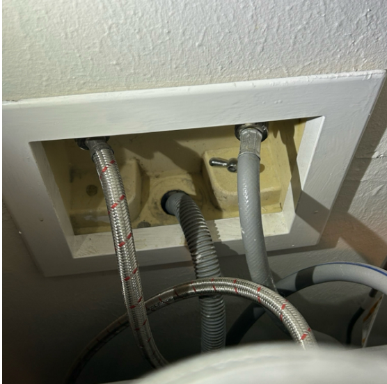
Other Treatment Photos

Checked interior plumbing, no current signs of leaks no current signs of termite activity.