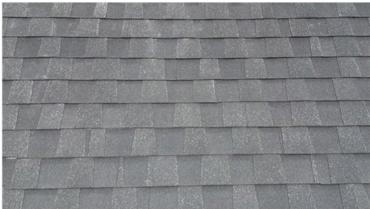
Granular Loss at Roof