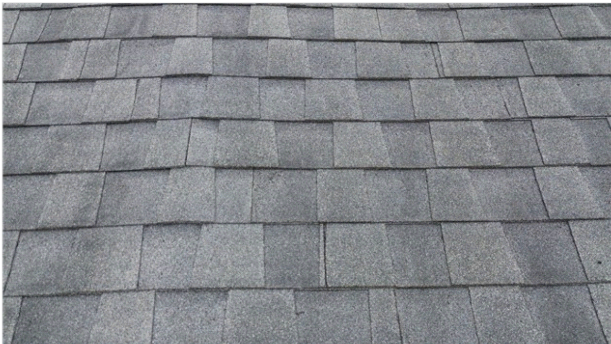
Granular Loss at Roof