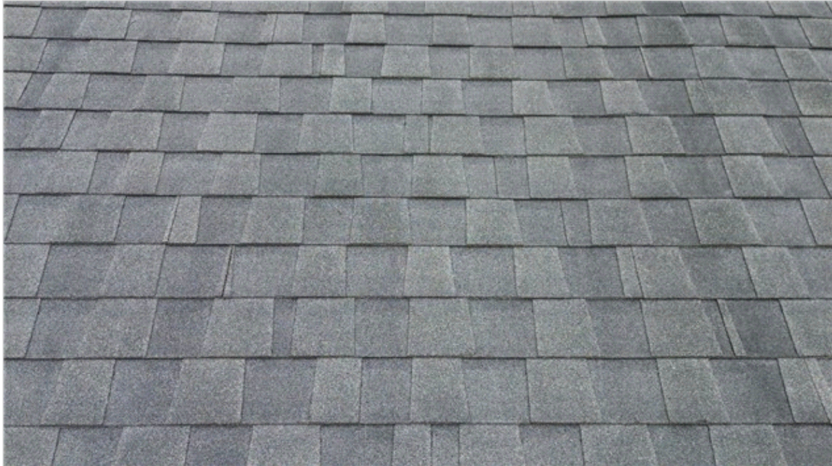
Granular Loss at Roof

*** Note: pictures with a RED border indicate a potential hazard, problem or defect ***