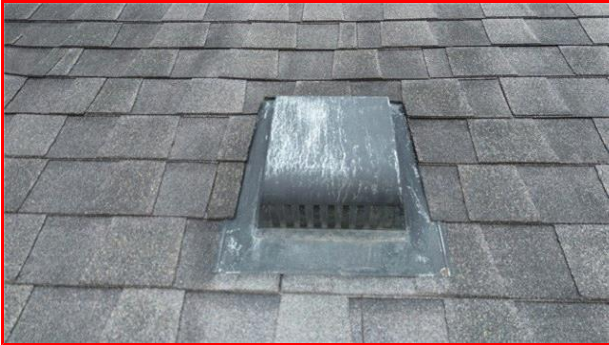
Vent not Properly Painted

*** Note: pictures with a RED border indicate a potential hazard, problem or defect ***