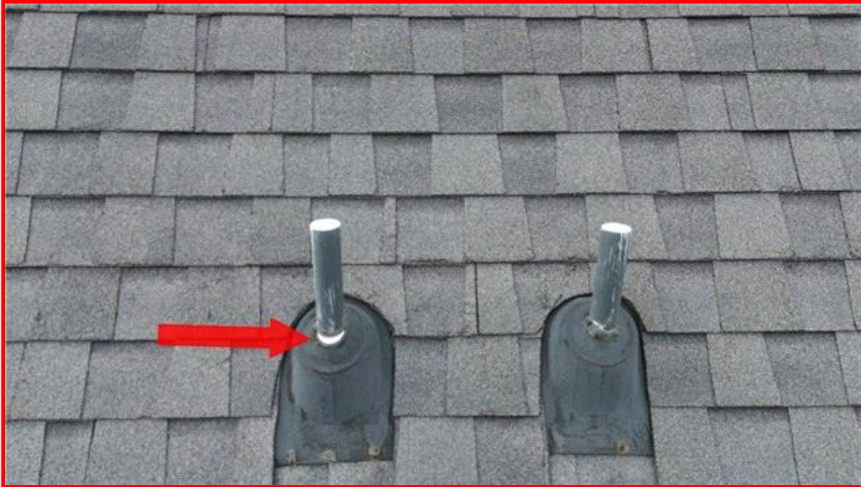
Plumbing Vent not Sealed to Roof Boot

*** Note: pictures with a RED border indicate a potential hazard, problem or defect ***