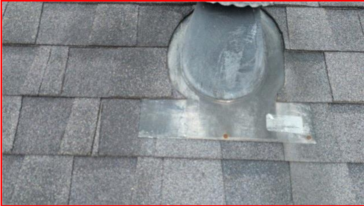
Vent not Properly Painted

*** Note: pictures with a RED border indicate a potential hazard, problem or defect ***