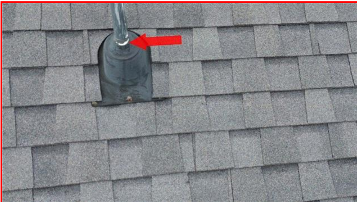
Plumbing Vent not Sealed to Roof Boot