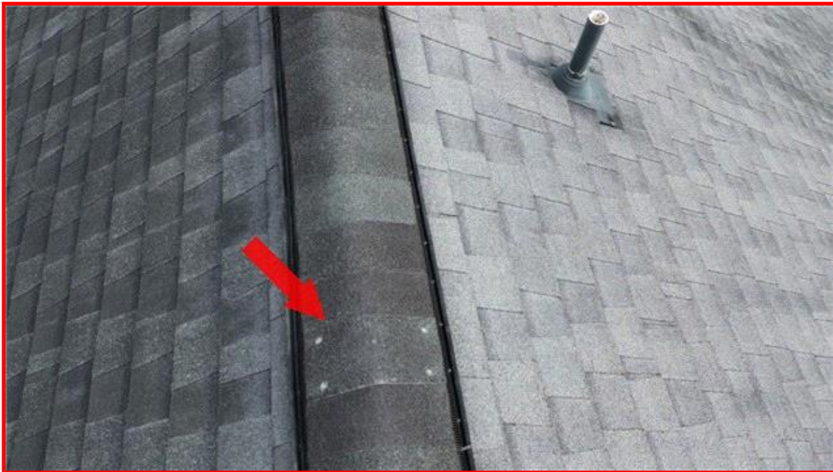
Exposed Nail Heads on Ridge