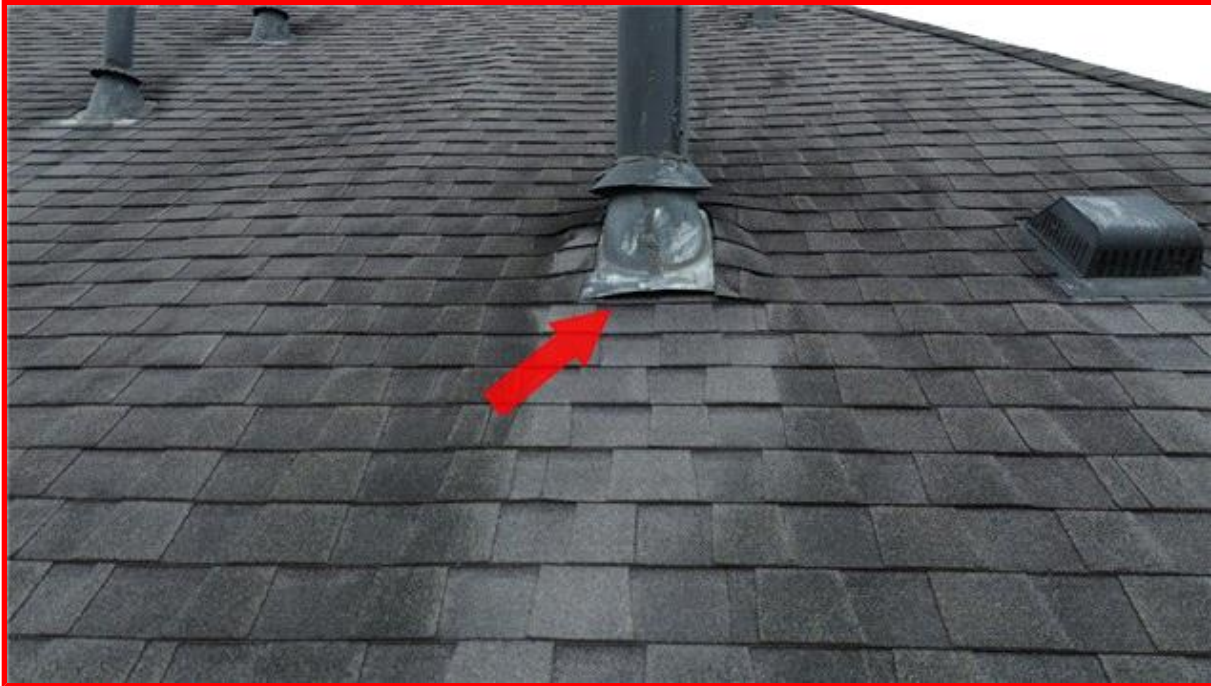
Raised Flashing at Chimney Flue

*** Note: pictures with a RED border indicate a potential hazard, problem or defect ***