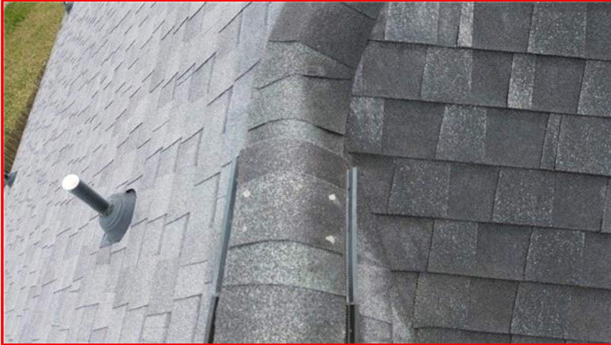
Exposed Nail Heads on Ridge

*** Note: pictures with a RED border indicate a potential hazard, problem or defect ***