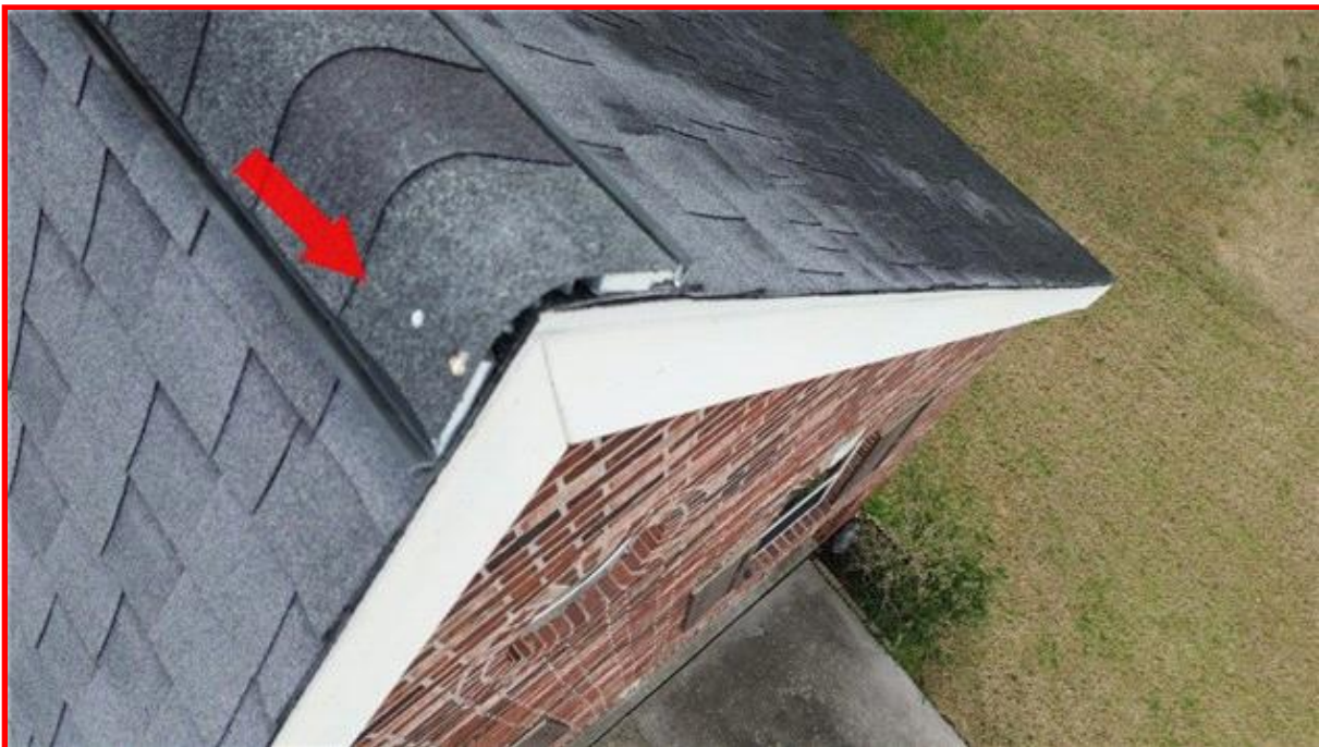
Exposed Nail Heads on Ridge