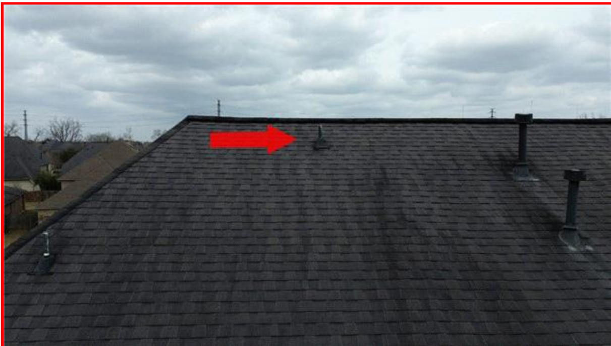
Loose Boot at the Rear By Top Ridge