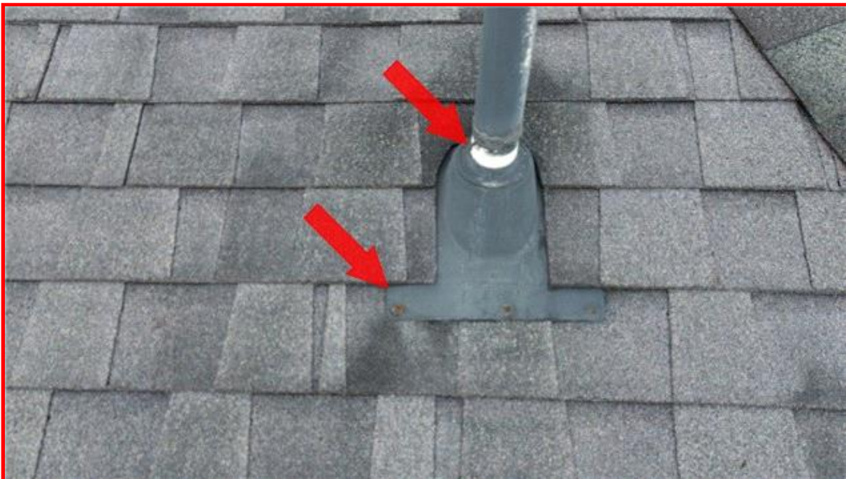
Plumbing Vent not Sealed to Roof Boot / Exposed Nail Heads