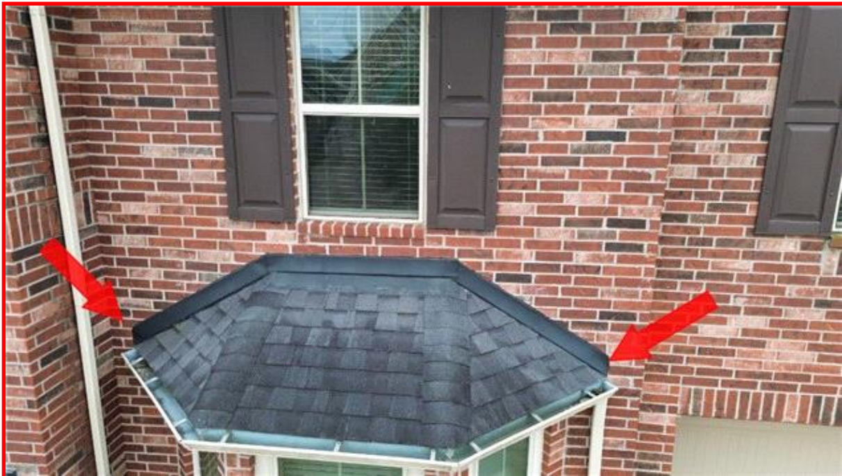
Kickout Flashing Missing at Front Bay Window