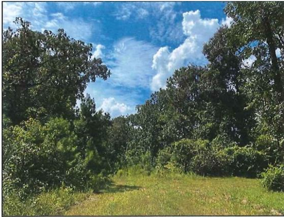
The image depicts property view before site clearing.