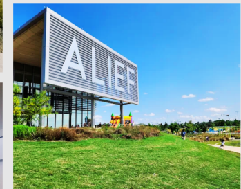
Alief Neighborhood Center and Park