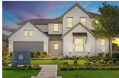
Hamilton Thomas Homes