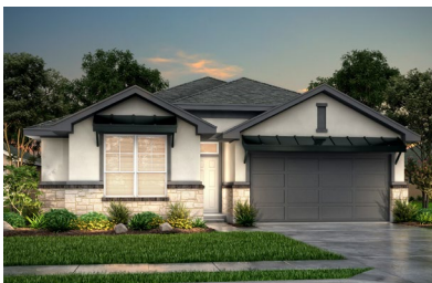
Willow at Marvida Homes for Rent