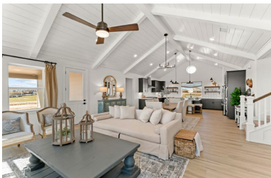
K. Hovnanian Homes