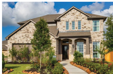
Smith Douglas Homes