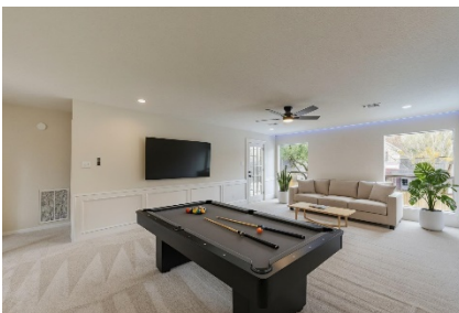
HUGE GAME ROOM