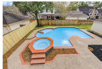
HUGE POOL & SPA