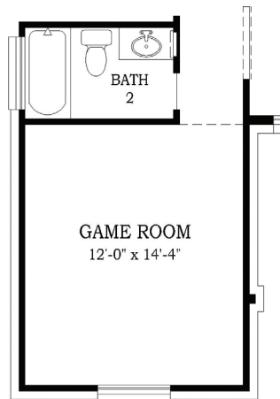
OPTIONAL GAME ROOM AT BEDROOM 4