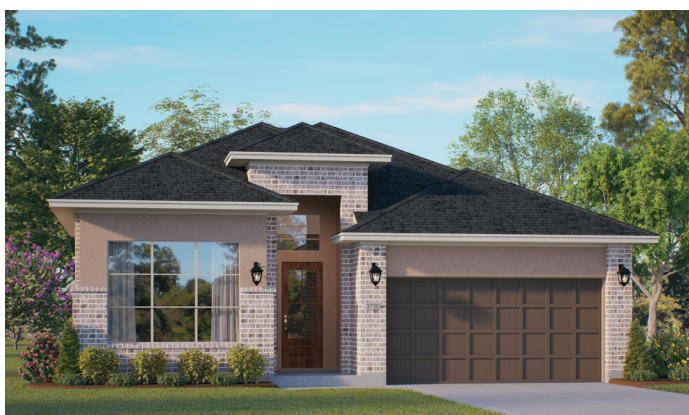
elevation E - brick/stucco