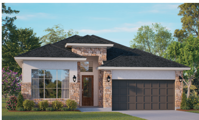
elevation E - stone/stucco