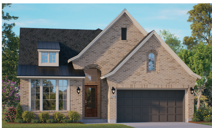
elevation D - brick