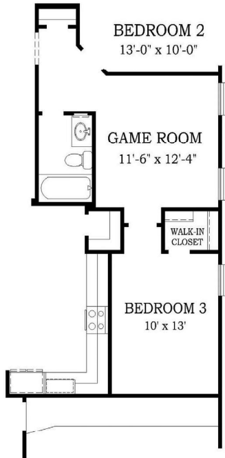
OPTIONAL GAME ROOM IN PLACE OF GARAGE STORAGE