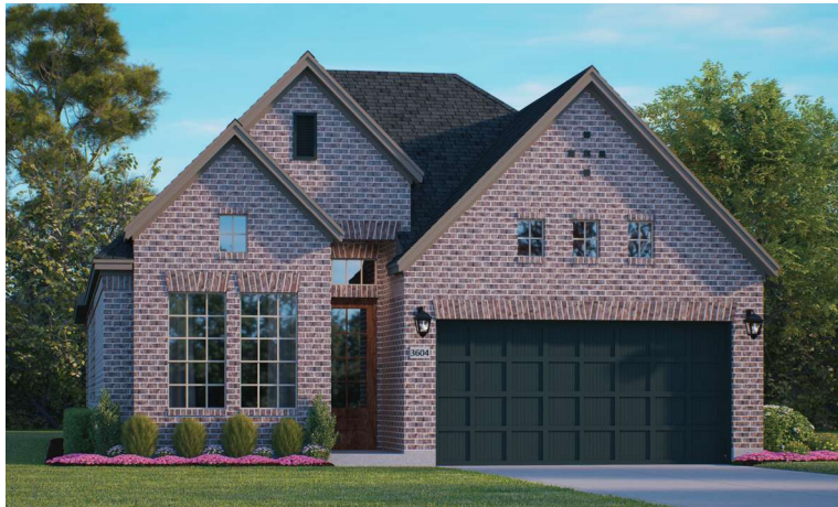
elevation D - brick