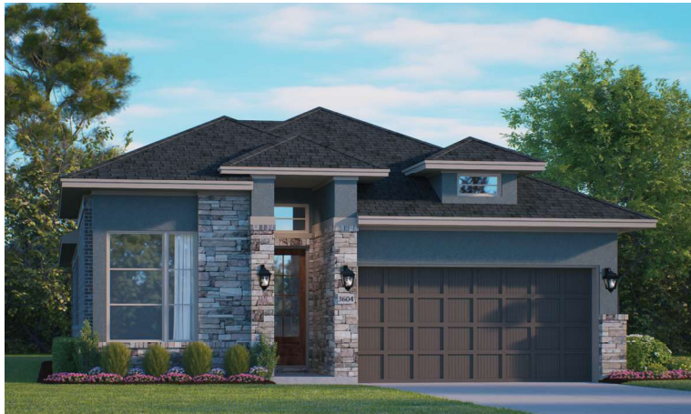
elevation E - stone

Availability of elevation options may vary by community, please ask your New Home Consultant for details on the current offerings in the community you are considering. Square footage and room dimensions are approximate and may vary per elevation. Window placement, roof line and porches may also vary by elevation. Plans, features, prices, and availability are subject to change without notice. Print date: 6-21-24