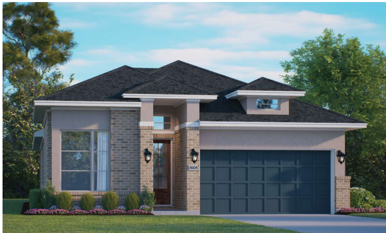
elevation E - brick