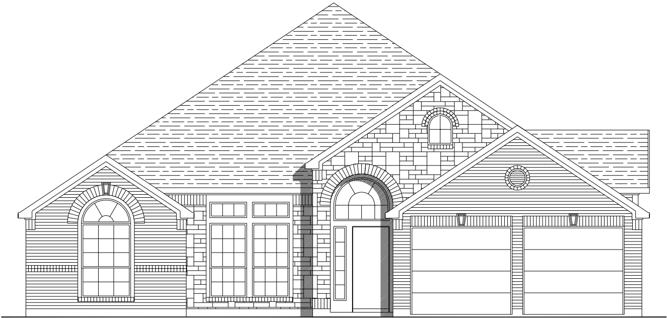
PLAN 2939W E-31

Some of the elevations shown may not be available in all communities.