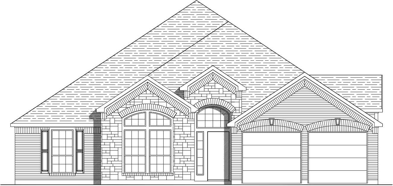
PLAN 2939W E-30