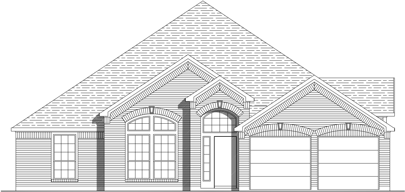
PLAN 2939W E-2