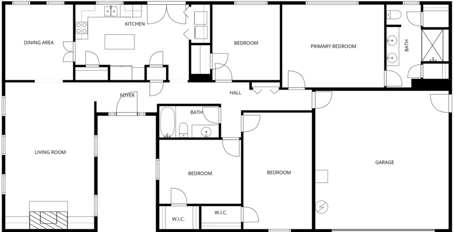
Floor plan provided for marketing purposes only. Buyer should verify dimensions and details.

This well-loved patio home pairs classic upgrades with an easy, versatile floor plan suited to many lifestyles. With new windows, recent system improvements, and a transferable foundation warranty, the home offers comfort and confidence from day one. Enjoy a tucked-away neighborhood feel with the convenience of Energy Corridor amenities and major freeway access just minutes away.