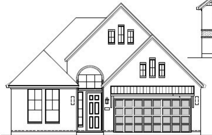
FRONT ELEVATION 'B1'

Availability of elevation options may vary by community, please ask your New Home Consultant for details on the current offerings in the community you are considering. Square footage and room dimensions are approximate and may vary per elevation. Window placement, roof line and porches may also vary by elevation. Plans, features, prices, and availability are subject to change without notice. Print date: 3.25.25