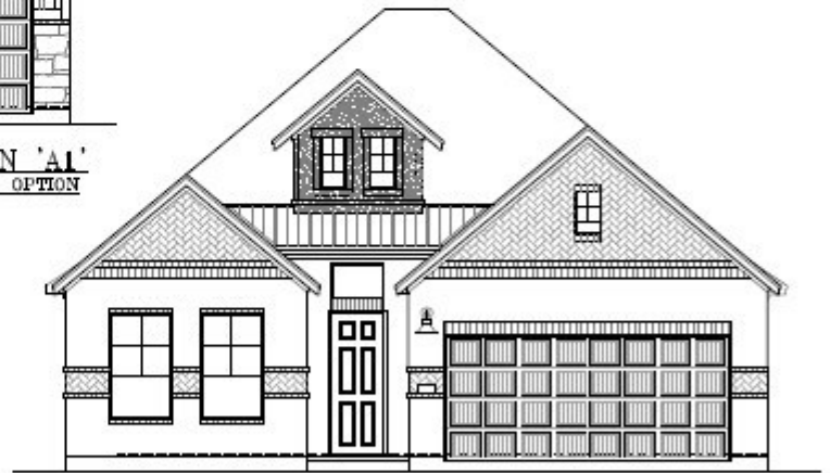
FRONT ELEVATION 'A1' BRICK OPTION