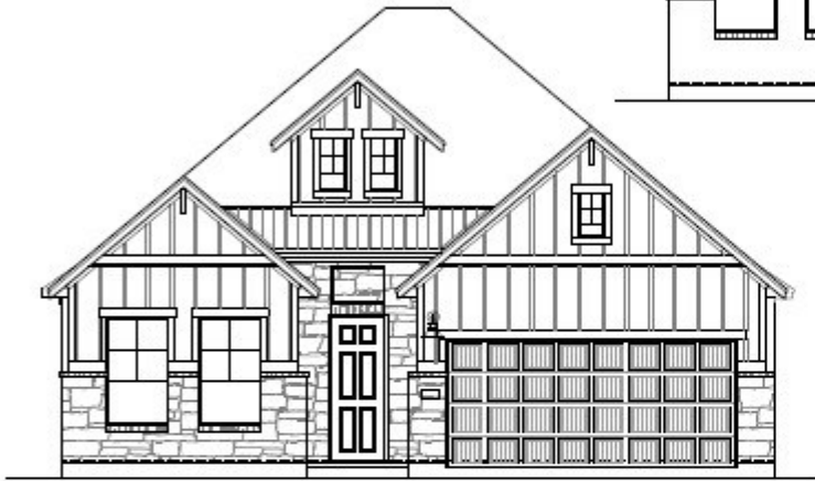
FRONT ELEVATION 'A1' STONE OPTION