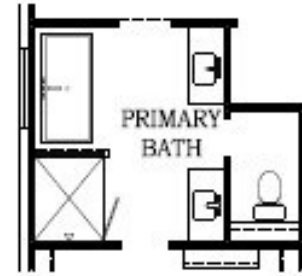
PRIMARY BATH WITH OPTIONAL TUB

ADDITIONAL APPLIANCE OPTIONS AVAILABLE PER COMMUNITY