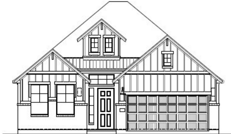
FRONT ELEVATION 'A1'