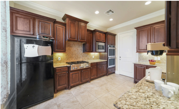
MAIN FULL KITCHEN