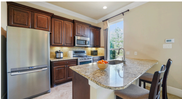
SECONDARY FULL KITCHEN