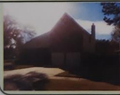
**** Covered Patio 23x17.

NOTE: AGREEMENT BY AND BETWEEN DEVELOPER AND H. L. & P. FOR INSTALLATION OF OVERHEAD/UNDERGROUND ELECTRICAL DISTRIBUTION SYSTEM OF NO. R269429. NOTE: AN AGREEMENT FOR CABLE TELEVISION SERVICES AND INSTALLATION AS PER HCCF NO. H680213.