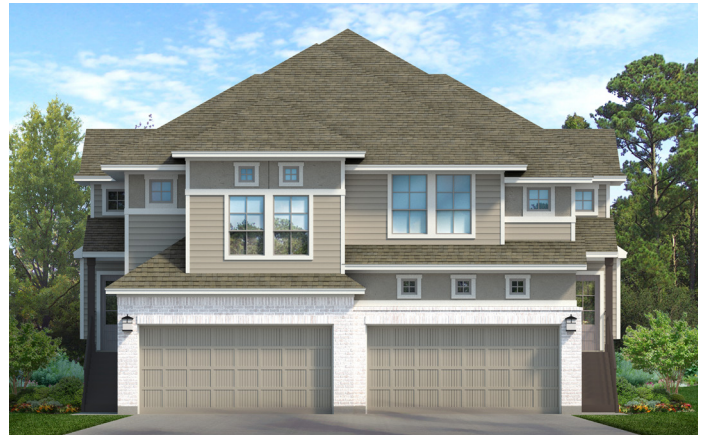
elevation N - Summerhouse