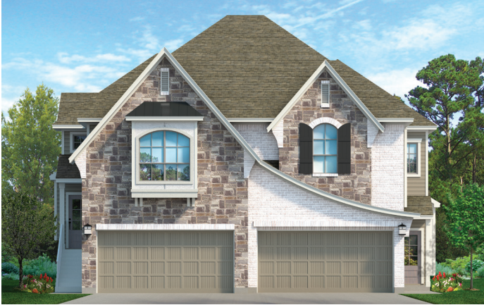
elevation J - Summerhouse