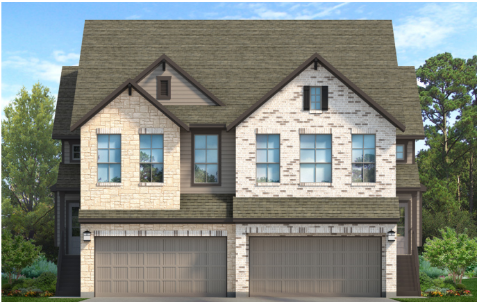
elevation L - Summerhouse