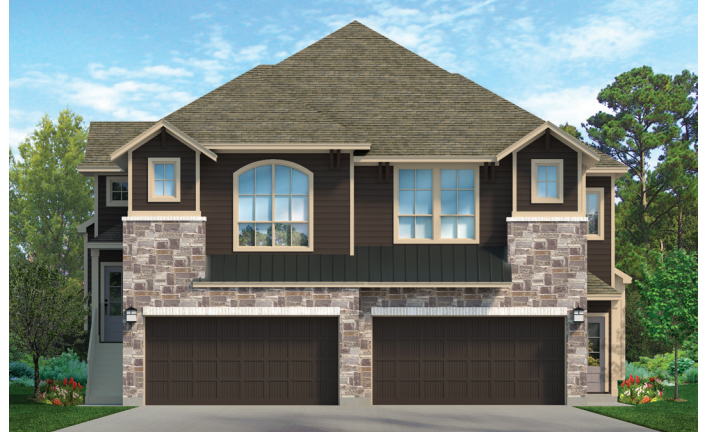
elevation K - Summerhouse