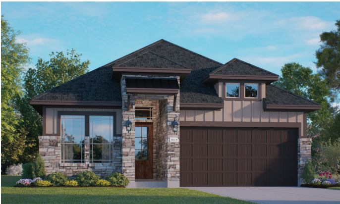
elevation C - stone