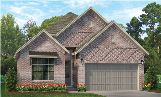
elevation B - brick