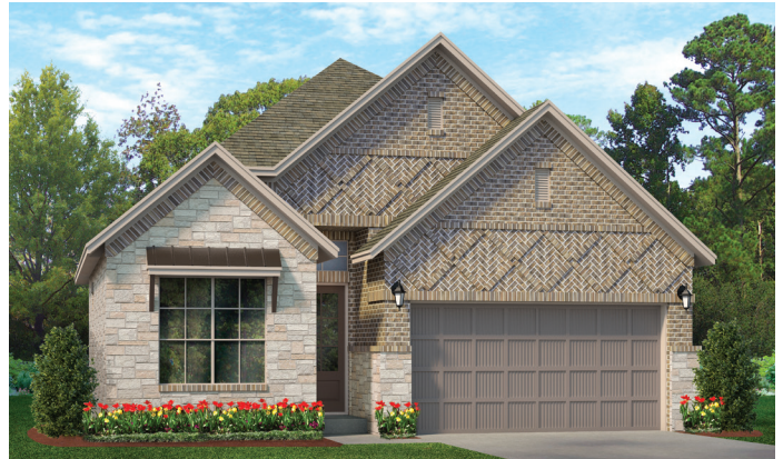
elevation B - stone