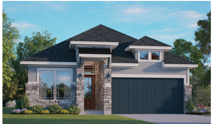
elevation C - stucco