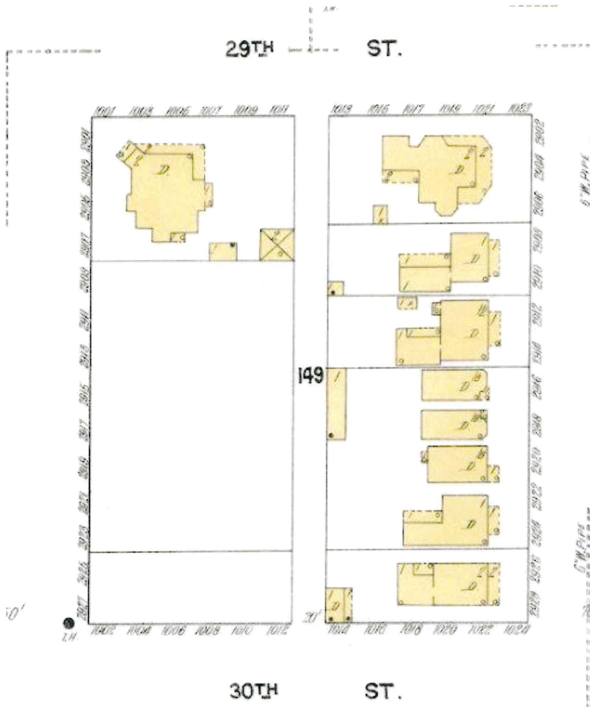
1912- Block 148, lots 1-5 vacant. The only existing residence on the south side of the 2900 block of Broadway seen is 2901 Broadway, the Van Alstyne house.