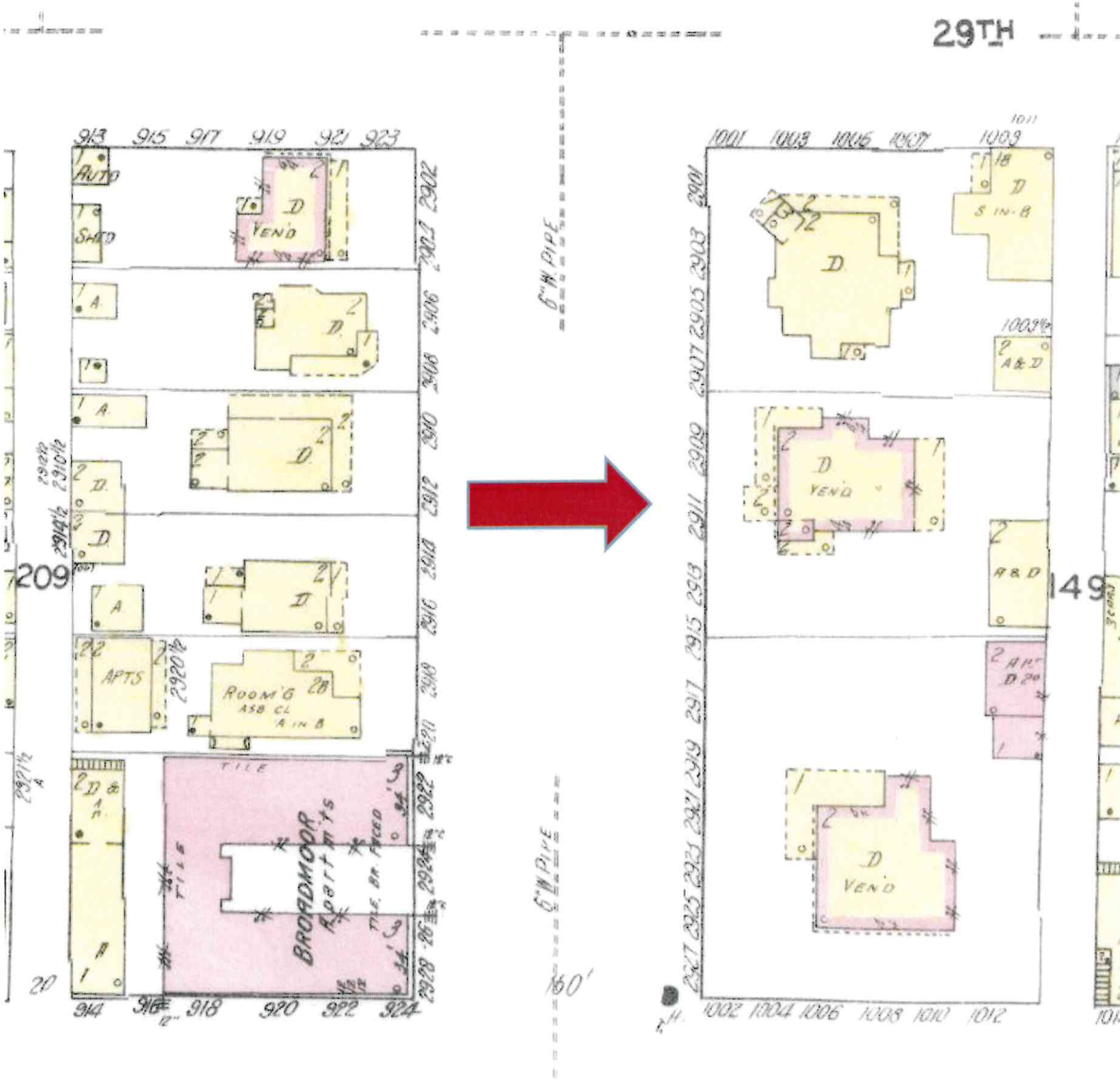
1947- Block 149. The footprint for the Bochman-Estrada house, built 1915, is recorded on the 1947 maps. The house was flanked by the Van Alstyne house to the east (2901 Broadway, built 1891) and the Baylis Harriss house to the west (2925 Broadway, built 1915, demolished 1964). On the north side of Broadway, the Broadmore Apartments are noted at 2922-2928 Broadway (demolished 2010) as is the Northern House, at 2902 Broadway (extant).