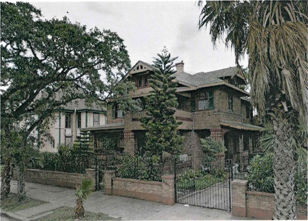
ATTACHMENT I: Bockman-Estrada House, 2911 Avenue J (Broadway Boulevard)