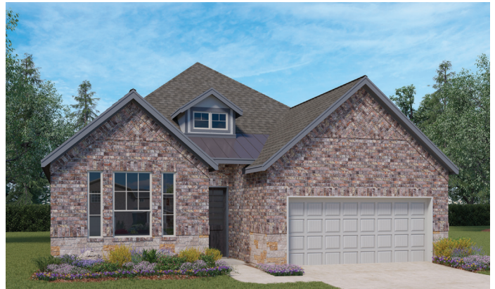
elevation B - stone