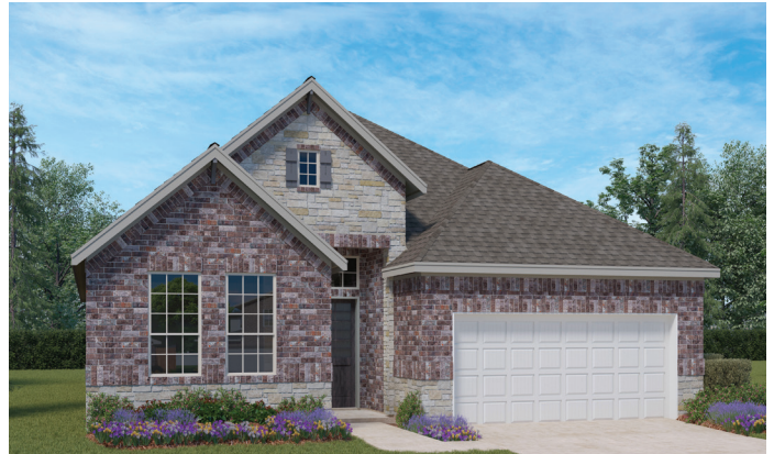
elevation A - stone