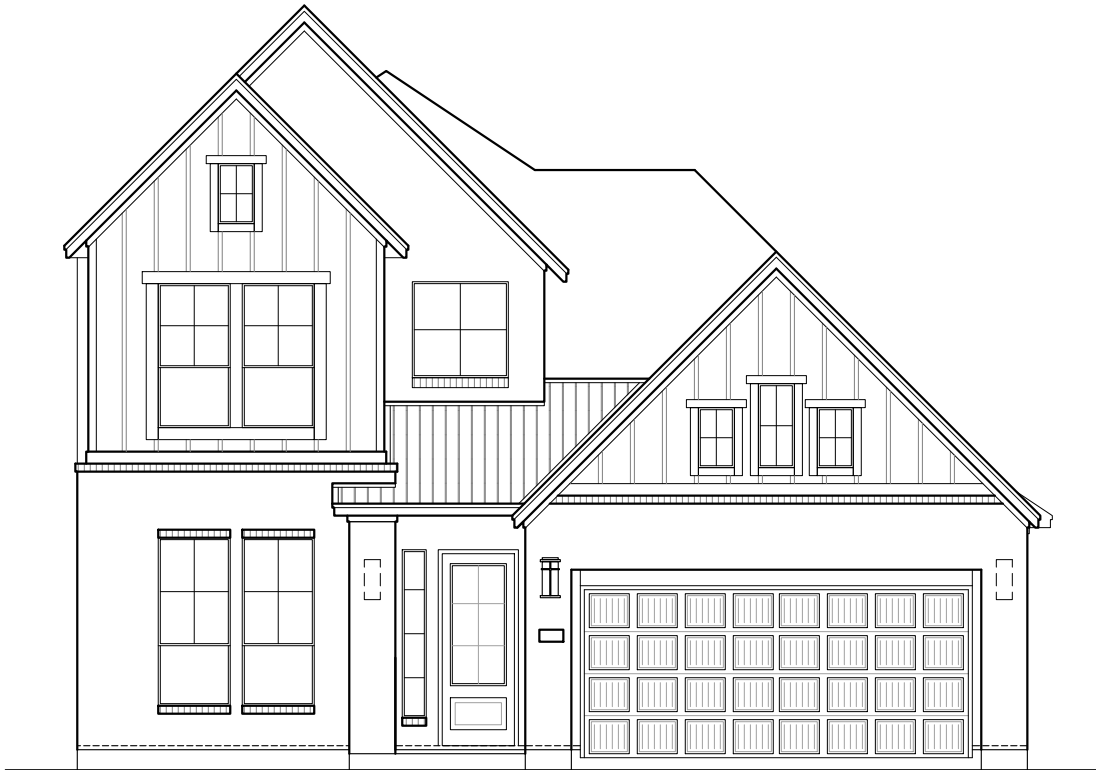
FRONT ELEVATION 'A1'

Plan 270040 | 2700 Square Footage | 4 Bedrooms | 3 Baths | 2-Car Garage