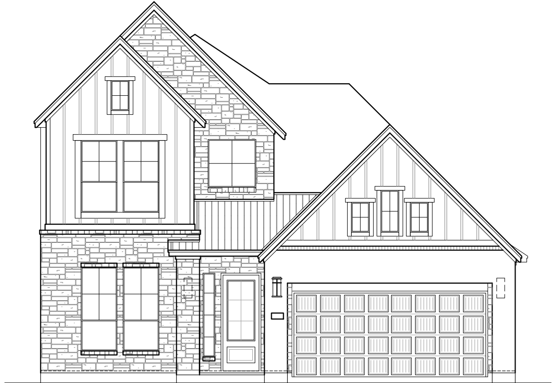
FRONT ELEVATION 'A1' STONE OPTION

Plan 270040 | 2700 Square Footage | 4 Bedrooms | 3 Baths | 2-Car Garage