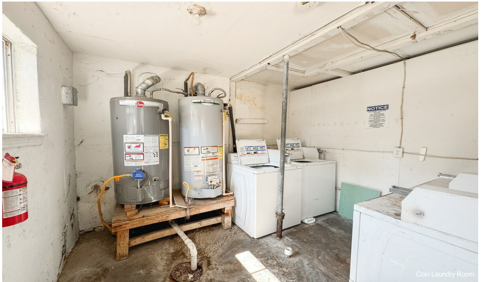
Coin Laundry Room