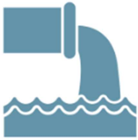
PROP A Drainage $40 M

Both bond propositions were passed on November 5, 2024. The bond election was canvassed on November 18, 2024.